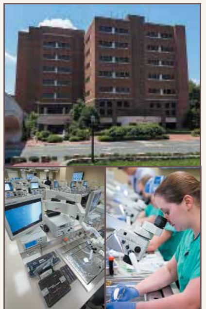
Skull Base & Spine Dissection Lab Simulation Center