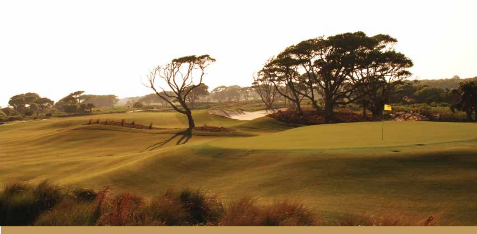
October 12-14, 2018 | Kiawah Island Golf Resort, Kiawah Island, SC